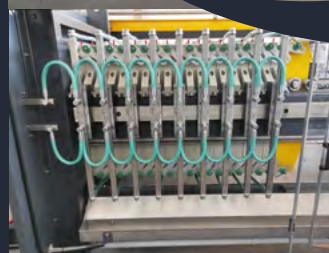
SIMULTANEOUS OPENING SYSTEM AND MEMBRANE SQUEEZING SYSTEM