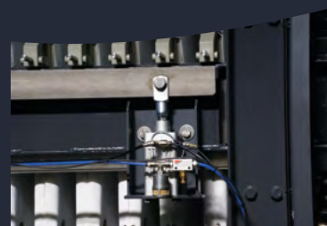
PLATE SHAKING BAR AND SQUEEZING SYSTEM