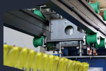
AUTOMATIC PLATE WASHING UNIT