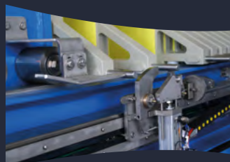
ONE-BY-ONE AUTOMATIC PLATE OPENING SYSTEM