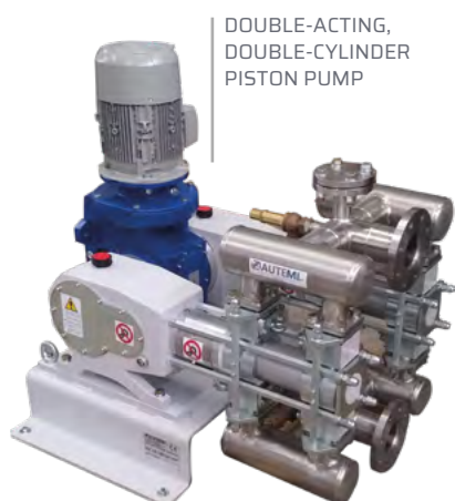
DOUBLE-ACTING, DOUBLE-CYLINDER PISTON PUMP

requirements. Flow rates up to 10 mc/h and pressures up to 15 bar. The range is completed by the LIBRA ME pump series, which represents the evolution of the LIBRA pump series with the addition of the membrane part useful for pumping highly abrasive liquids, where the normal pumping piston alone would be inefficient. The design and construction of these pumps was done to make maintenance as easy as possible.