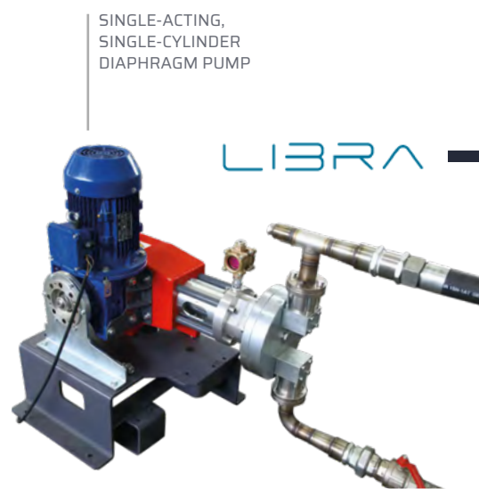
SINGLE-ACTING, SINGLE-CYLINDER DIAPHRAGM PUMP